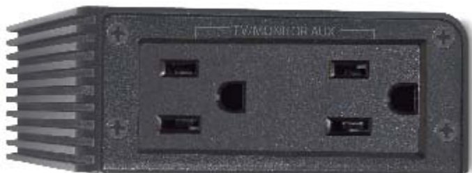
Figure 3. C2/C2-CN Outlet Panel

This section describes outlet panel functionality. The outlet panel for the C2/C2-CN Power Filter is shown in Figure 3. Outlet panel descriptions are provided immediately below Figure 3.