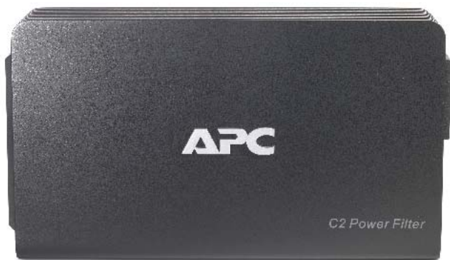
Figure 1. C2/C2-CN Wall Mount Power Filter - Front View

Isolated noise filter bank (INFB) technology eliminates electromagnetic interference and radio frequency interference (EMI/RFI) as sources of audio and video signal degradation, and data line surge protection jacks stop surges from traveling over phone lines.