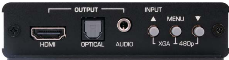
Figure 3 - Output