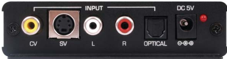
Figure 2 - Input