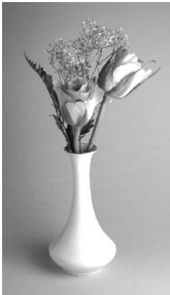
5. Finished photo.

Lowel Ego is a product of Lowel-Light, the Academy Award Winning World Leader in Location Lighting.