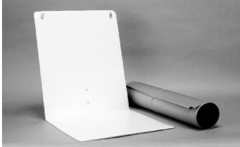
1. Unpack the background & paper

This background is designed for use with the Lowel Ego light. By attaching supplied background paper, you can create a sweep - a background without a visible corner.