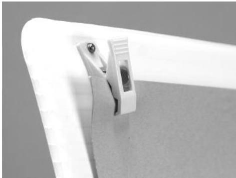
3. Choose paper color & attach to clips. Tape front ends of paper down if curling is too great.