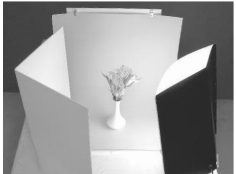
4. Place object, & arrange lighting. Experiment to achieve best results. Keeping object towards front end of sweep will minimize shadows