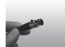
TA4-F for most Shure® wireless transmitters.

Do NOT attempt to re-terminate the microphone yourself. Making physical changes to the CO-3, such as changing the cable termination or electronics, will void your warranty.