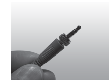
3.5mm locking mini connector for Sennheiser® Evolution wireless transmitters.