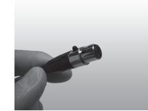
TA4-F for most Shure® wireless transmitters.

Do NOT attempt to re-terminate the microphone yourself. Making physical changes to the CO-3, such as changing the cable termination or electronics, will void your warranty.