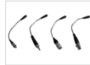
X-Connectors are interchangeable

Your microphone is equipped with an interchangeable X-Connector of a termination as specified at the time of purchase. To remove, simply grasp the end of the microphone cable firmly with one hand and twist off the X-Connector end until separated.