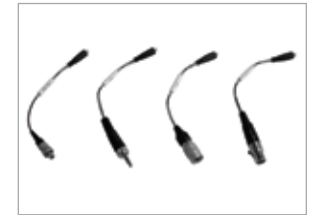
X-Connectors are interchangeable

Your microphone is equipped with an interchangeable X-Connector of a termination as specified at the time of purchase. To remove, simply grasp the end of the microphone cable firmly with one hand and twist off the X-Connector end until separated.