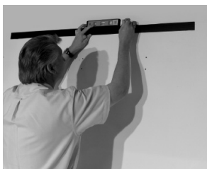
Step 1: Use level to mark top line. Step 2: Repeat for set line.