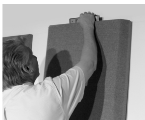
Step 4: Level panel on Set line