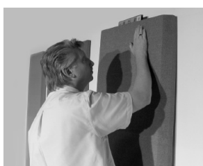
Step 5: Even downward pressure

Congratulations on purchasing Primacoustic Broadway™. Broadway is a series of fabric covered, high density, (6 lb per cubic foot) rigid fiberglass panels designed to control echo and absorb secondary reflections in any reverberant environment. Because Broadway panels are also Class-1 fire rated, they are ideally suited to provide effective acoustic control in applications as diverse as home-theatre, practice rooms, houses of worship, offices, call centers and broadcast studios.