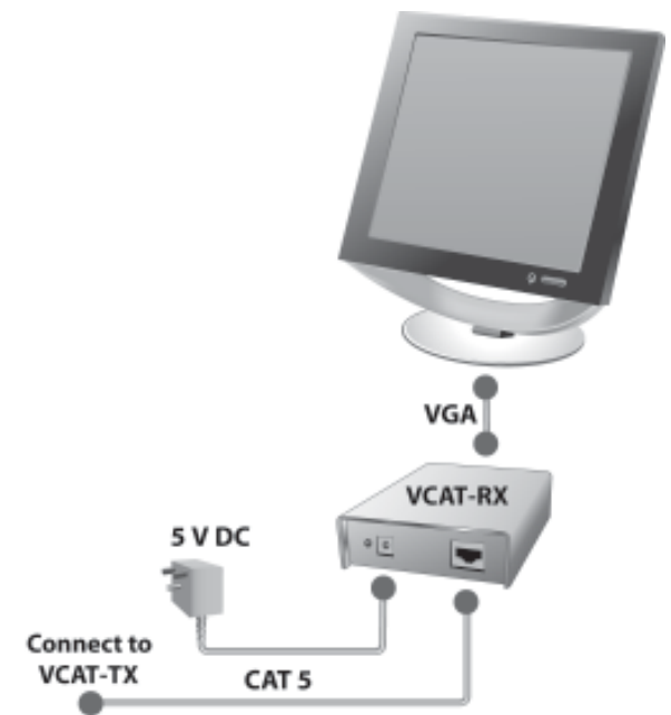
VCAT Receiver Installation Diagram