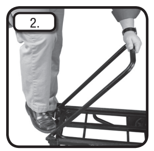
STEP 2: While applying pressure to release cable, raise foldable side to upright position.