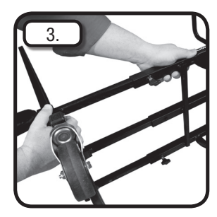
STEP 3: Adjust frame to desired shortened length.