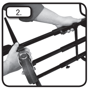
STEP 2: Extend frame until it snaps into lengthened position.