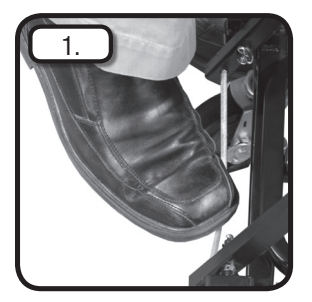
STEP 1: Apply pressure to release cable with foot or hand.