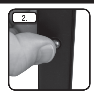
STEP 2: Disengage position pin.