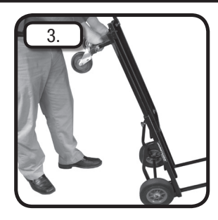
STEP 3: Deep equipment hand truck in final position.