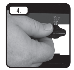
STEP 4: Tighten springloaded wing nuts.