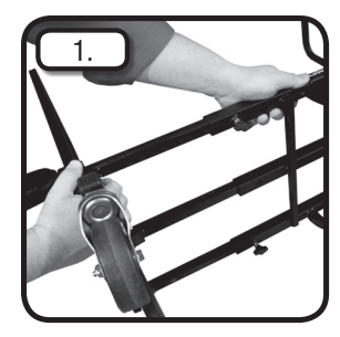
STEP 1: Extend frame (see instructions above).