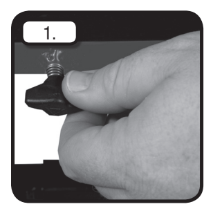
STEP 1: Loosen springloaded wing nuts.