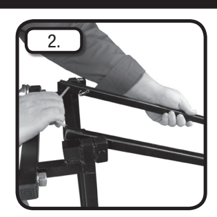
STEP 2: Stand cart upright on large wheels and lower foldable side by pulling release cable.