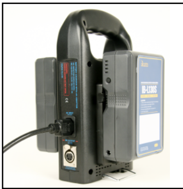
1. Charging Operation