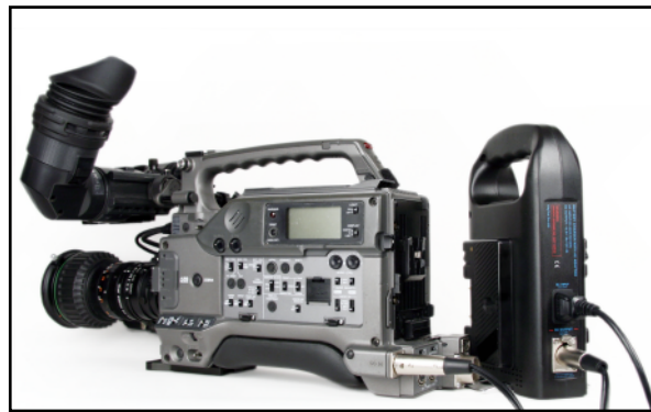
2. 12V DC Adapter Operation