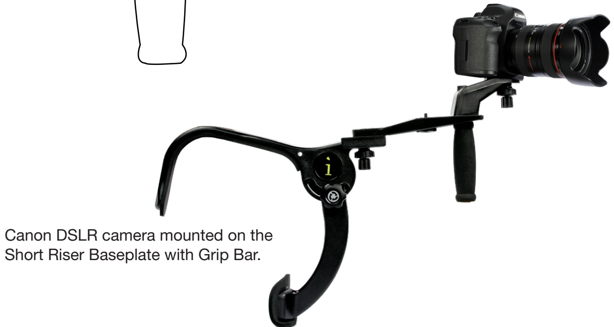
Canon DSLR camera mounted on the Short Riser Baseplate with Grip Bar.