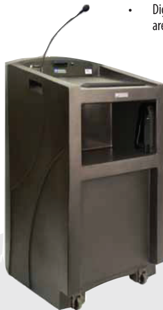
ST3250 Pinnacle Non-Amplified Lectern (back view)

CUSTOMIZE any Lectern with your Company Logo