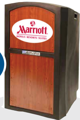
SN3250 Pinnacle Non-Sound Lectern

CUSTOMIZE any Lectern with your Company Logo