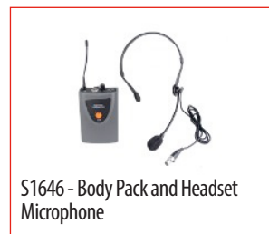
S1646 - Body Pack and Headset Microphone