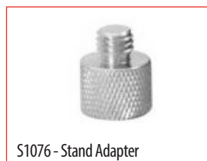
S1076 - Stand Adapter