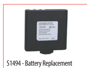
S1494 - Battery Replacement