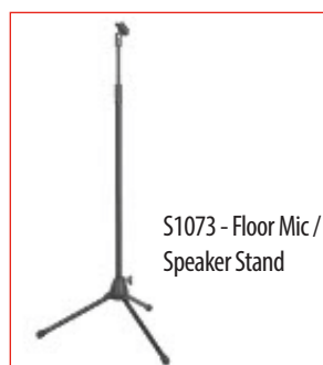
S1073 - Floor Mic / Speaker Stand