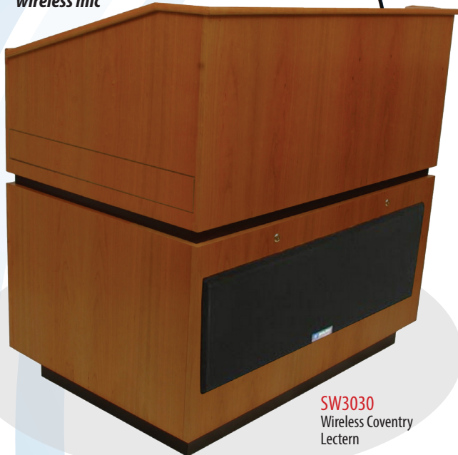
SW3030 Wireless Coventry Lectern