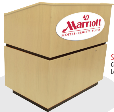
SN3030 Coventry Lectern

Customize any Lectern with your Company Logo