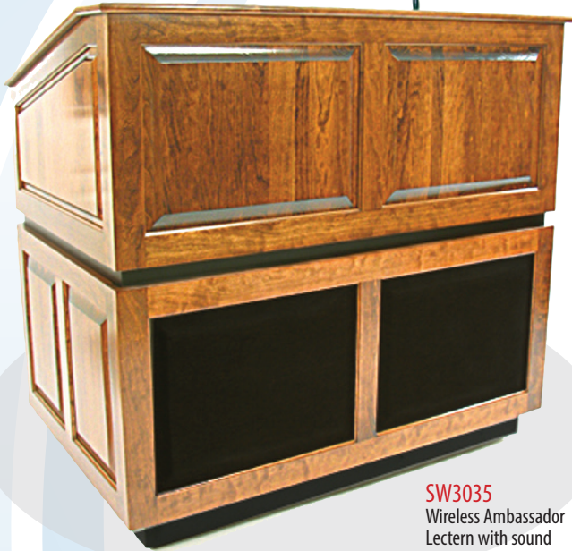
SW3035 Wireless Ambassador Lectern with sound