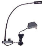
S1110 Halogen Lamp Sleek Style and pure bright white light illuminates the reading surface of any lectern. Flexible 17.5" gooseneck allows for adjustment.

Custom lectern cover available for order