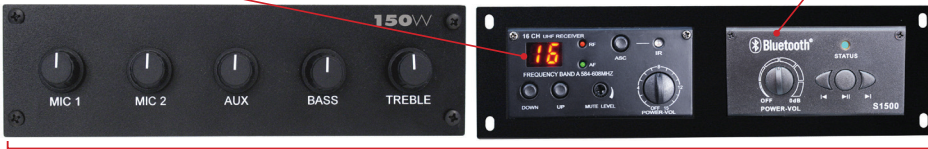
Control Panel, includes fingertip controls, Bluetooth ( SW3035 and SS3035 only ) and wireless receiver ( SW3035 only )