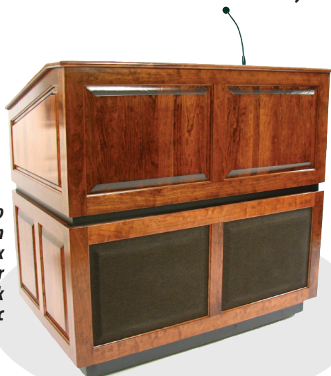
SS3035 Ambassador Lectern with Sound

Stand up to 20' away, with Sensitive AmpliVox Electret Condenser Gooseneck Hot Mic