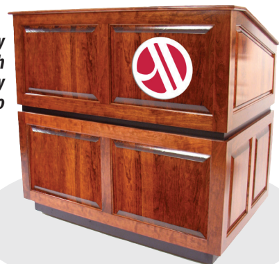
SN3035 Ambassador Lectern

Customize any Lectern with your Company Logo