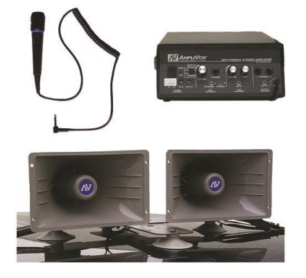
312 - 2 HORN SERIES Wired microphone not included in wireless model