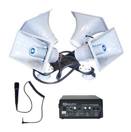
314 - 4 HORN SERIES Wired microphone not included in wireless model

Thank you for choosing the S312 , SW312 , S314 , SW314 Sound Cruiser Car Top PA System from AmpliVox Portable Sound Systems .