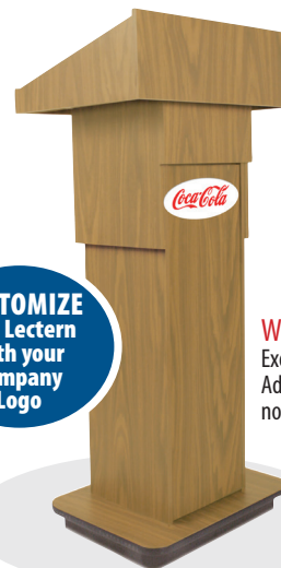
W505A Executive Adjustable Height non-sound Lectern

CUSTOMIZE any Lectern with your Company Logo