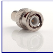
2 x 75 \Omega Terminator