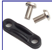
Power Adapter Fastener