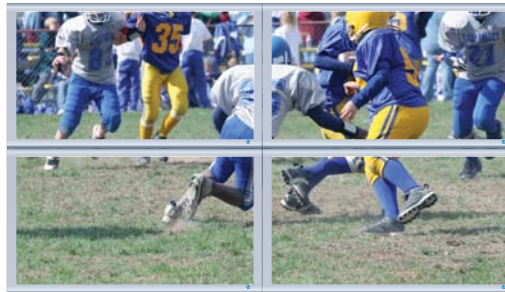
Event Broadcasting (2x2 video wall, requires 4 DIDO Pro, Jr, or LT)