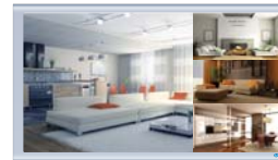
Surveillance (quad mode, requires 1 DIDO Pro)