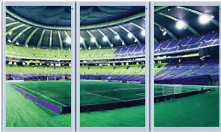
Event Broadcasting (real-time image rotation, requires 3 DIDO Pro or Jr)

Below are a few examples of what is possible with DIDO Technology.