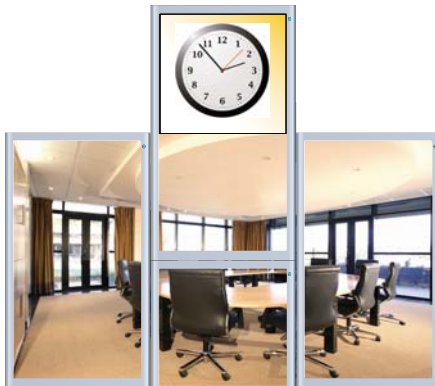
Conference Room 1A 10:30 AM - 12:00 PM Investor Relations Committee 1:00 PM - 1:30 PM Sales / Marketing Dept. 3:30 PM - 4:45 PM Public Relations Task Force Digital Signage (real-time image rotation, requires 4 DIDO Pro or Jr)