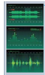
Statistical Monitoring (real-time image rotation, requires 1 DIDO Pro)

For more information on this and other products, please visit www.auroramultimedia.com