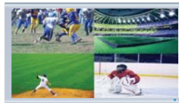
Sports Bars (quad mode, requires 1 DIDO Pro)