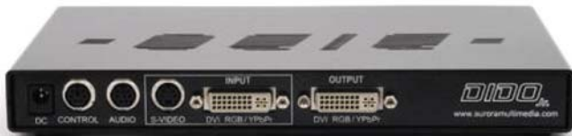
DIDO Jr/DIDO LT rear panel