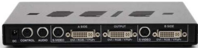
DIDO Pro rear panel