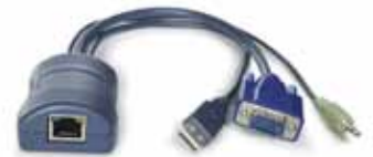
Example CAM: CATX-USB-A

CAM: Computer Access Module PS/2 only: CATX-PS2 PS/2 plus audio: CATX-PS2-A USB only: CATX-USB USB plus audio: CATX-USB-A Sun plus audio: CATX-SUNA Single Rack Kit: RMK-ALIP Dual Rack Kit: RMK-ALIP-Dual Serial upgrade cable: CAB-9M/9F-2M Slave power switch for connection to AdderView CATxIP 1000 or master power switch: PSU-8SLAVE Master power switch for connection to AdderView CATxIP 1000 or standalone Ethernet operation: PSU-8MASTER