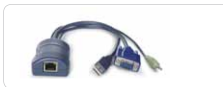
Example CAM: CATX-USB-A

Master Power Switch for connection to AdderView CATx IP or standalone Ethernet operation: PSU-8MASTER