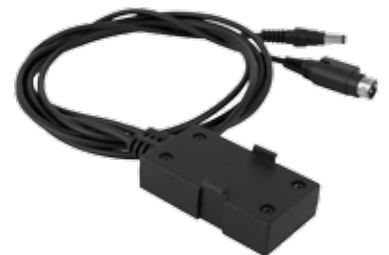
Above: PSU-RPS-5V. 12V to 5V converter power adaptor

VSC48: 2m 3-pin locking to 3-pin locking power lead PSU-RPS-5V: 12V to 5V converter power adaptor. 2 meter PSU-RPS-5V-5M: 12V to 5V converter power adaptor. 5 meter RMK4D-R2: Rack mount bracket with holder for power adaptor (PSU-RPS-5V) PSU-RED-460W: Additional 460W power module