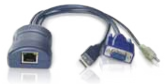
Example CAM: CATX-USB

CATX-PS2 (PS/2 only) CATX-USB (USB only) CATX-SUNA (Sun plus audio) X200 (console extension)