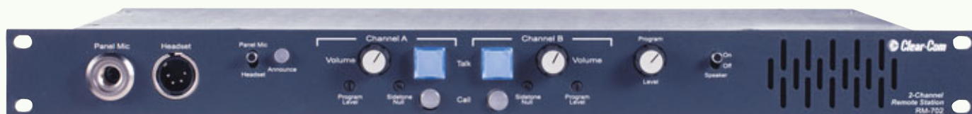
RM-702 Front Panel

The RM-702 is one of a series of professional remote intercom stations. The remote speaker/headset station allows two-channel selectable talk and listen in one rack space. The operator can talk and listen on either channel separately or talk to both channels simultaneously without tying the two channels together. Specially contoured audio response provides excellent speech intelligibility, even in high-noise environments.