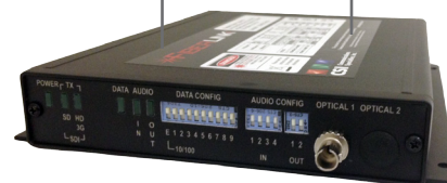
Fiberlink® 3391 Transceiver

The Fiberlink® 3390 Series is available in a card version that is compatible with the Fiberlink® 6000A Rackmountable Card Cage.