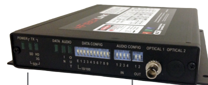
Fiberlink® 3390 Transceiver

Front Panel LEDs quickly reveal the 3390's Video & Data input status