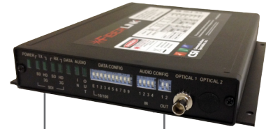
Fiberlink® 3394 Transceiver

Dip Switches allow for quick selection of your audio & data configuration