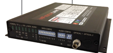
Fiberlink® 3395 Transceiver

Available as a box or a card to fit the 6000A rackmount chassis