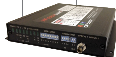
Fiberlink® 3395 Transceiver

Available as a box or a card to fit the 6000A rackmount chassis