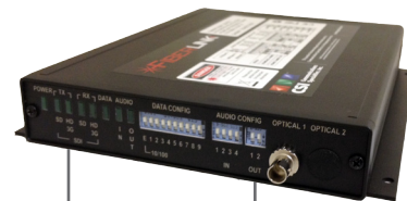
Fiberlink® 3394 Transceiver

Dip Switches allow for quick selection of your audio & data configuration