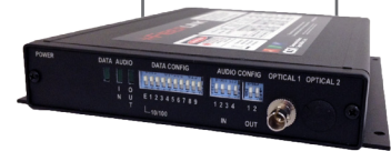
Fiberlink® 5201 Transceiver

The Fiberlink® 5200 Series is available in a card version that is compatible with the Fiberlink® 6000A Rackmountable Card Cage.