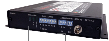
Fiberlink® 5200 Transceiver

Front Panel LEDs quickly reveal the 5200's Audio & Data input status