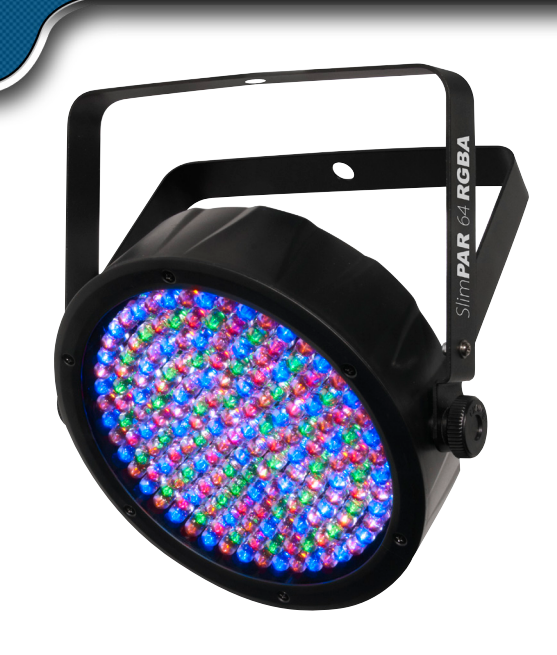
Weight: 2.8 lb (1.3 kg) Size: 10.8 x 10.8 x 2.6 in (276 x 275 x 66 mm)