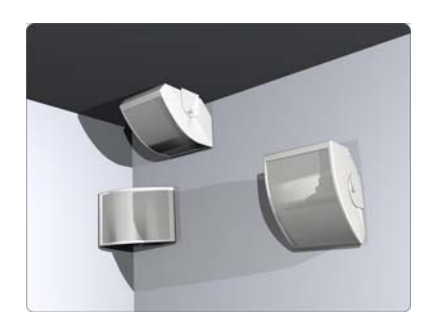
Wall, corner and ceiling mounting is possible using the optional yoke bracket sold separately.