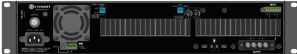
DCi 2|1250 model shown