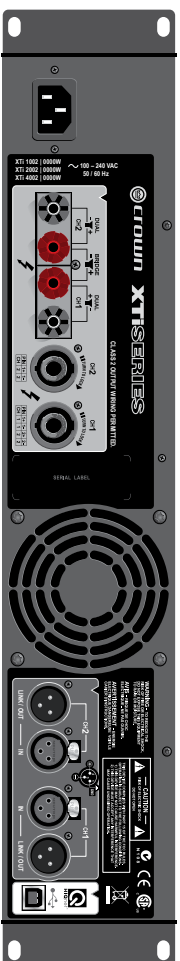
XTi 1002, 2002, 4002