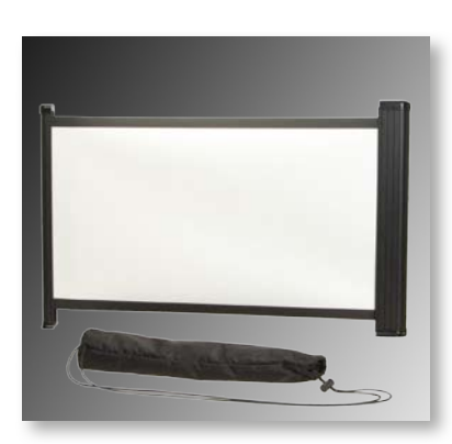
Carrying Case included