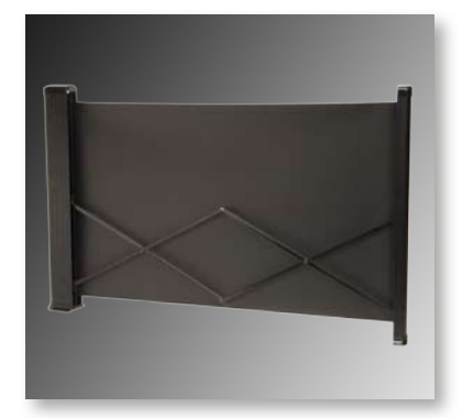
Scissor mechanism is infinitely adjustable