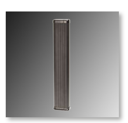
Only 19" long when closed