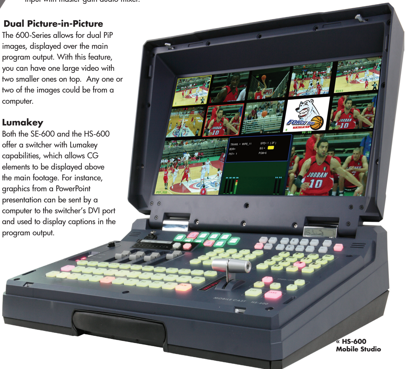
« HS-600 Mobile Studio

The 600-Series is made with powerful features, such as an integrated audio mixer, dual PiP, Lumakey, and assignable auxiliary outputs.