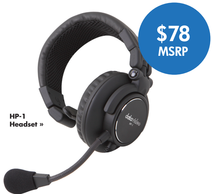
HP-1 Headset »