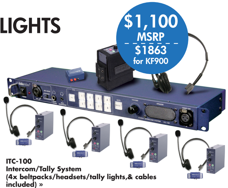
ITC-100 Intercom/Tally System (4x beltpacks/headsets/tally lights,& cables included) »

Use the CB-29 Cable to connect the ITC-100 Intercom/Tally System to the SE-2800 Switcher.