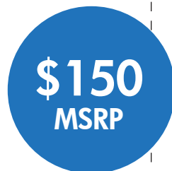
TB-5 Tally Light Kit »