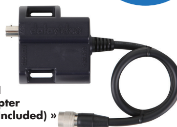
AD-1 Adapter (4x Included) »