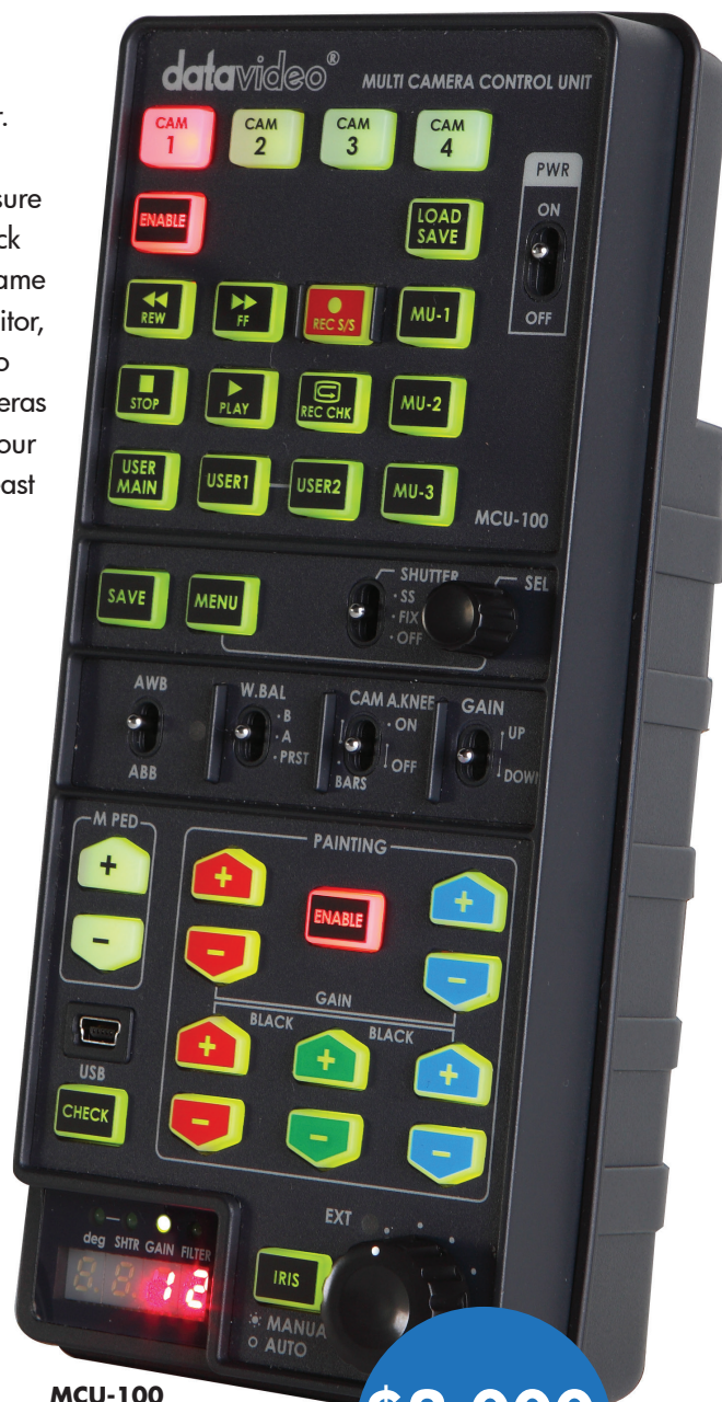
MCU-100 Controller »