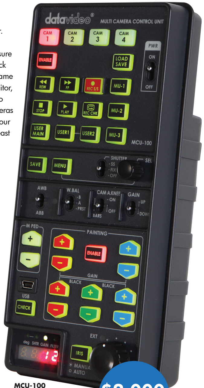
MCU-100 Controller »