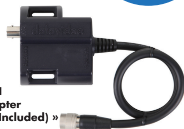
AD-1 Adapter (4x Included) »