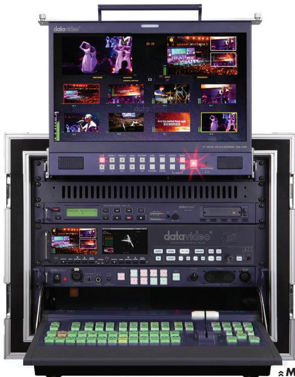
≈ MS-2800 Mobile Studio

If a complete package is of interest, look no further than the SE-2800 Studio Kit. This complete system includes the SE-2800 Switcher, combined with a communication system, two tabletop monitors, and a hard drive recorder, mounted to the included rack mount. The setup provides a wired intercom and tally system with 4x belt packs,