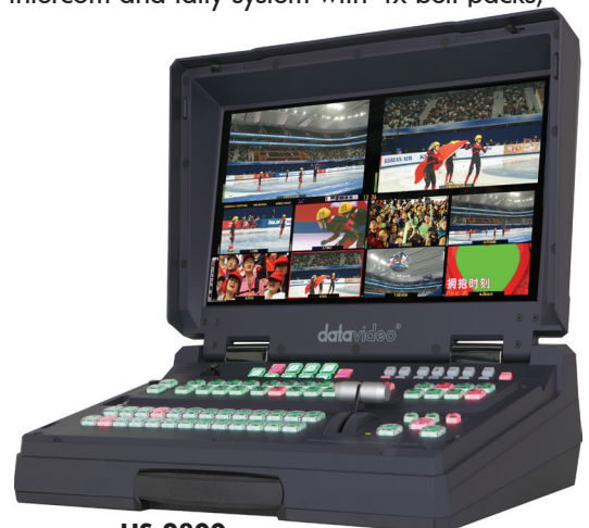
≈ HS-2800 Mobile Studio