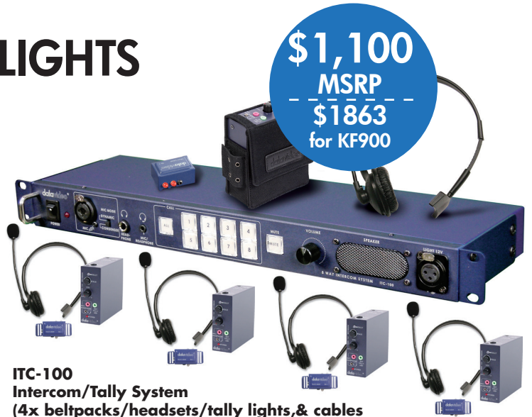
ITC-100 Intercom/Tally System (4x beltpacks/headsets/tally lights,& cables included) »

Use the CB-29 Cable to connect the ITC-100 Intercom/Tally System to the SE-2800 Switcher.