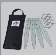
Deluxe Stake Kit