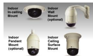
Support all kinds of mounting application