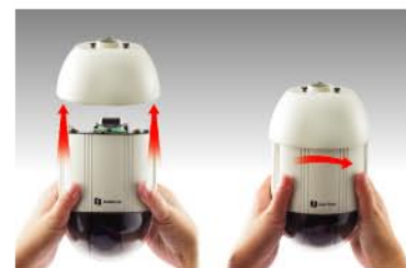
Plug & latch quick installation

With high pan/tilt speed at up to 240°/second, the EPTZ100 will capture any fast moving objects and all the actions so you don't miss a beat. The EPTZ100 also offer enhanced features such as privacy zone, noise reduction, pattern tours and many more, providing you with state-of-the-art PTZ surveillance.