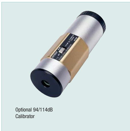
Optional 94/114dB Calibrator