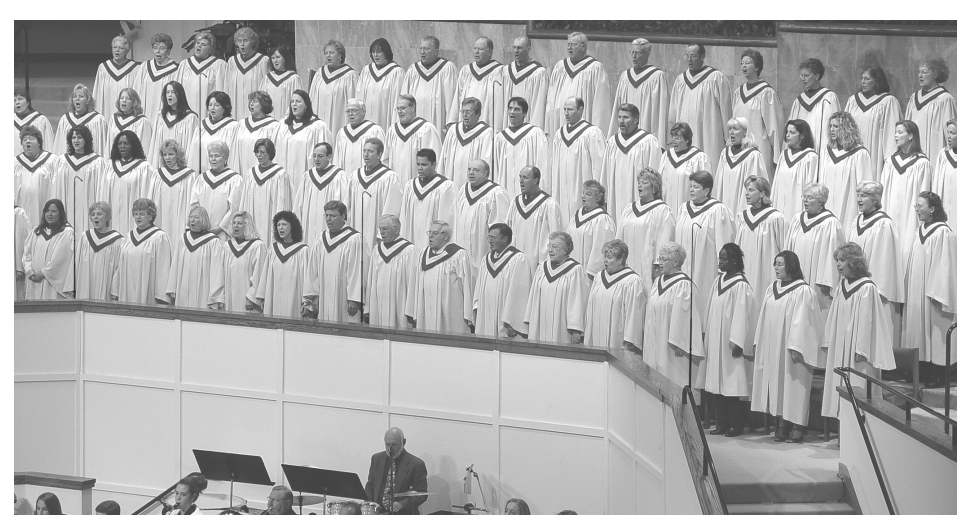
Find the FW730 7 ft. FlexWands in the above photograph. How many FlexWands do you see?

During the last decade it has become commonplace for sound recording and broadcast equipment to accommodate extended frequency responses up to and beyond 100kHz. With few exceptions, even the very best of conventional professional microphones do not offer frequency responses above 20kHz. However, making a High Definition Microphone<sup>™</sup> involves far more than extending the frequency response. Impulse response, diaphragm settling time and pristine electronics are also key elements. Earthworks' founder David Blackmer foresaw the need for higher quality microphones. Earthworks has been offering High Definition microphones, with extended frequency response beyond 40kHz, since 1996. Earthworks High Definition Microphones<sup>™</sup> have an extremely clean, natural on-axis pickup, and smooth, uncolored off-axis response with high front-to-back rejection that makes them superb for a wide range of applications including sound reinforcement, broadcast, and recording of voice and musical instruments. You will hear exceptional sound quality that is extremely accurate,