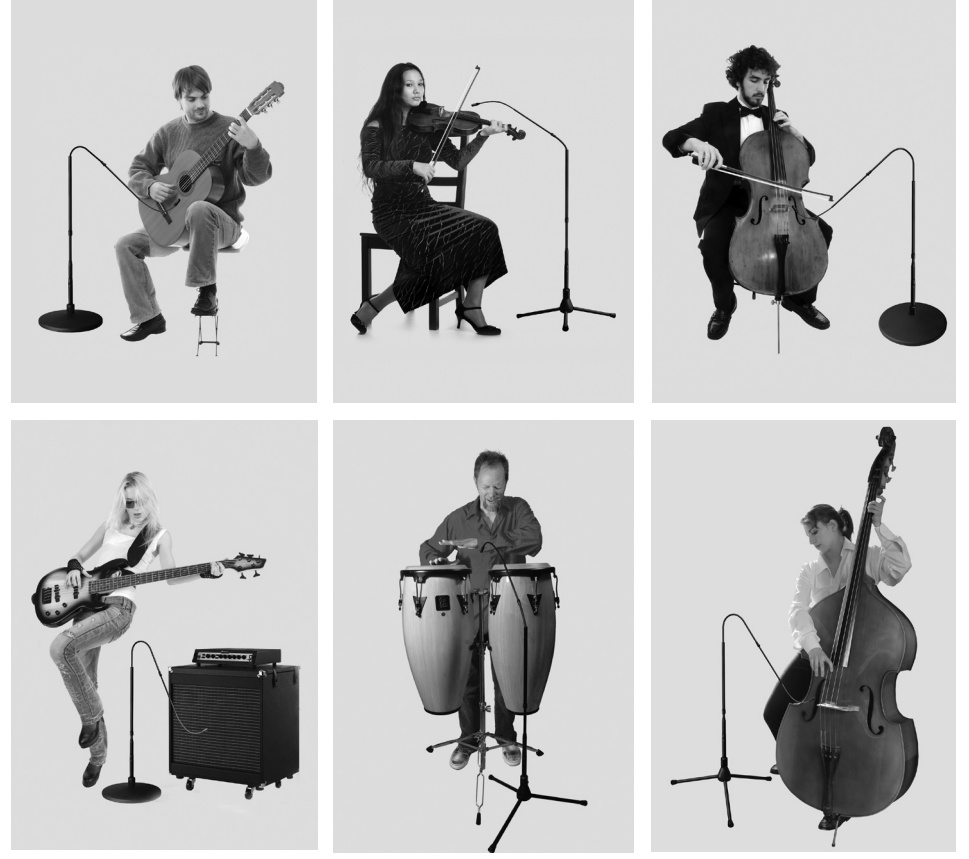
Various applications of the 4 ft. FW430 FlexWand Microphone System

detailed, open and crystal clear even on 16 bit, 44.1kHz recording systems as well as analog or digital sound systems that are limited to a 15kHz or 20kHz bandwidth. You will hear a remarkable improvement in sound quality on nearly all audio systems when using Earthworks High Definition Microphones<sup>™</sup>.