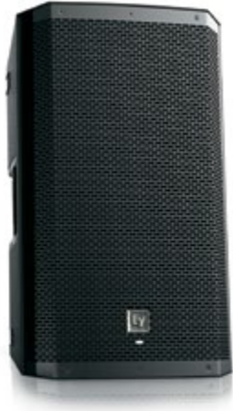
12 ZLX-12P 12" TWO-WAY POWERED LOUDSPEAKER

The compact, lightweight ZLX-12P was designed to give you power and performance beyond the scope of other small-format loudspeakers, making it a standout choice for smaller-venue sound reinforcement or stage-monitoring. Pound for pound, no other similarly sized composite box comes close.