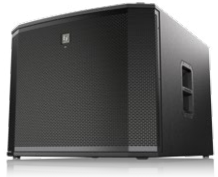
18 SUB ETX-18SP 18" POWERED SUBWOOFER

18" DVX woofer for extended low-frequency response