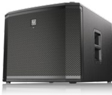
15 SUB ETX-15SP 15" POWERED SUBWOOFER