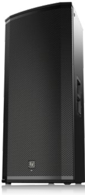
35 ETX-35P 15" THREE-WAY POWERED LOUDSPEAKER