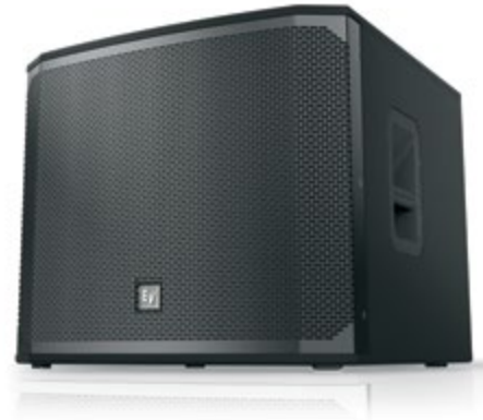
18 SUB E KX-18S