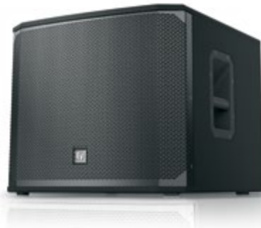
15 SUB E KX-15S

90° x 60° pattern for best coverage on mid-size stages. 40° monitor angle with rubber feet.