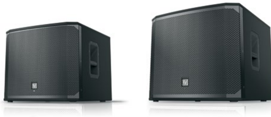
15 SUB EKK-15SP 15" POWERED SUBWOOFER