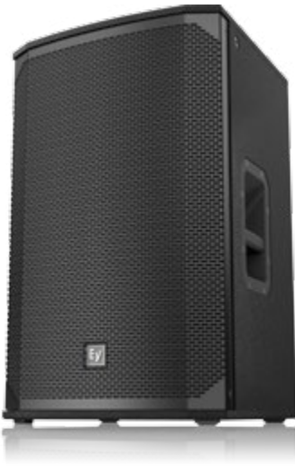
15 E KX-15