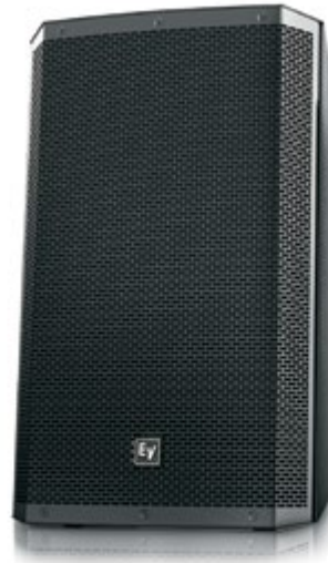
15 ZLX-15 15" TWO-WAY PASSIVE LOUDSPEAKER

The ZLX-15 gives you the confidence of the industry's most trusted components – engineered to exacting standards to bring exceptional EV audio quality for larger applications, with or without a subwoofer.