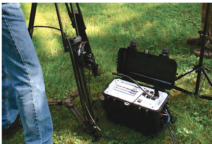
When equipped with Bidirectional fiber, BrightPak supports outbound sound and picture, with return video, sound, and ifb