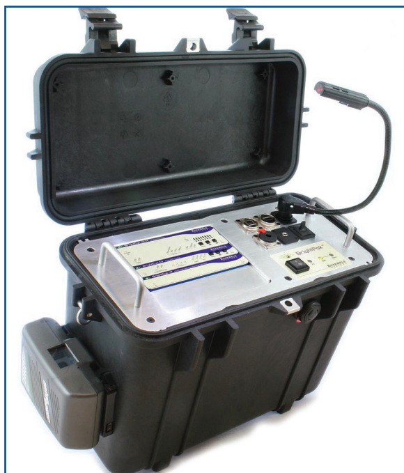
Built from a tough Pelican case, it will stand up to a lot of abuse

100-230 VAC 50/60Hz universal power supply suitable for worldwide operation. Automatic detection/selection of AC versus battery power (BrightPak is not a charger for the battery). BrightPak will switch automatically to battery if the AC power is lost – without any on-air glitch or interruption. IEC power connection installed in the connector side bay. Power on/off switch, AC/Battery indication, and Low Battery Indicator on top plate. Internal fan-out connections of 12 volt power for use with BrightEyes and/or other user-supplied devices. Internal USB Hub with Neutrik 'D' type USB connector. USB connector can be installed in connector side bay or on top plate as desired.