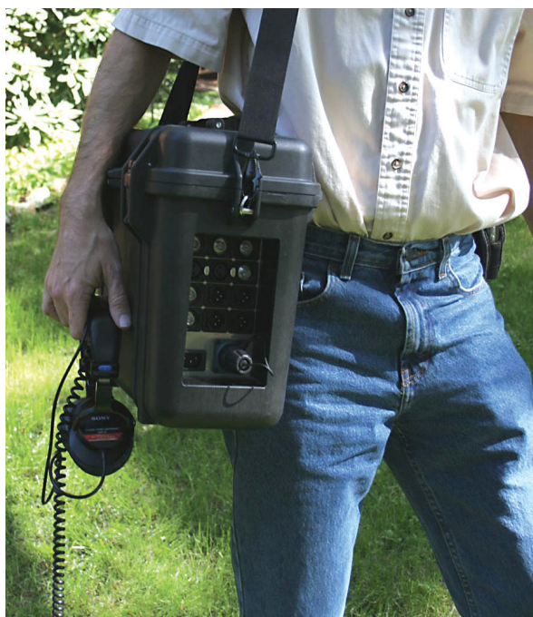
A flexible field case that lets you take video converters, SPGs, and optical transmitters anywhere