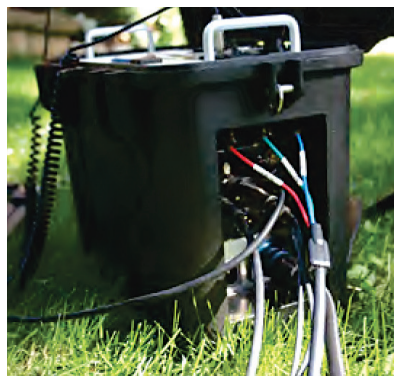
On location, it's the interface point for picture, sound, and communication