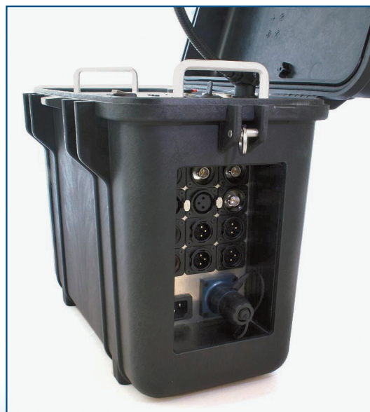
Configure the versatile connector bay to provide exactly the inputs and outputs you need

The BrightPak Basic Kit includes a "D" mount USB connector, an internal USB hub, and all cables needed to support three BrightEye units. The USB connector can be installed in either the side bay or on the top plate. A laptop connected to that connector will have full control over all of the BrightEye units.