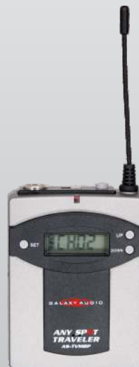
Wireless Body Pack AS-TVMBP