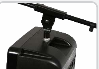
Integrated Mic Boom Socket. Mic boom and hardware sold separately.