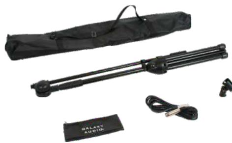
Accessories included in each kit